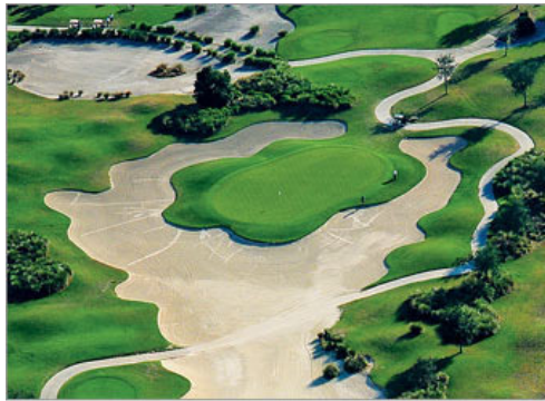
The Timacuan golf course runs through the town's center.

Lake Mary may be only 30 minutes from Orlando and 45 from Daytona Beach, but residents have plenty of shopping, restaurants and events in their own backyard. There are lakes for boating and fishing, and the Timacuan golf course lies in the center of town. Recreation is one thing, but jobs keep Lake Mary humming. On weekdays the population rockets from less than 14,000 to more than 35,000 as commuters arrive.