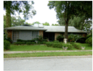
LONGWOOD, FL-Sabal Point MUST SELL! 4 beds/2 baths, 2699 S/F Bring All Offers! Offered at $299,900