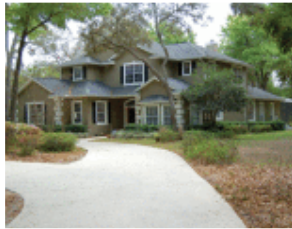
LAKE MARY, FLORIDA 4 Beds/ 3 baths Over 3600 S/F, wood flrs Over 2 acres of land! Offered at $589,000