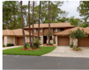
LONGWOOD, FL A Little Slice of Paradise! 3 beds/2.5 bath townhome Located in Wekiva Offered at $145,000