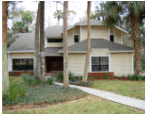
LONGWOOD, FLORIDA OUTSTANDING FLOOR PLAN! 4 beds/3 baths, 3038 S/F Private lot. Over 1/3 acre Offered at $385,000